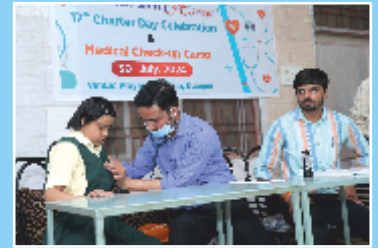
मानसिक रूप से विकसित लड़की का मेडिकल चेकअप करते हुए