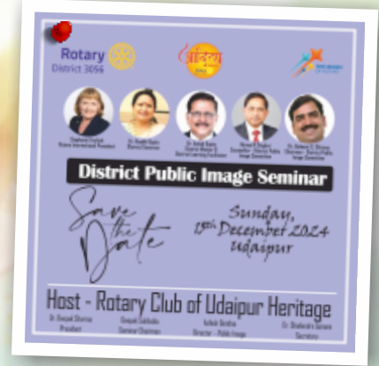
Flier of Dist. Public Image Seminar to be organised by the club released at Kota on 11th Aug., 2024