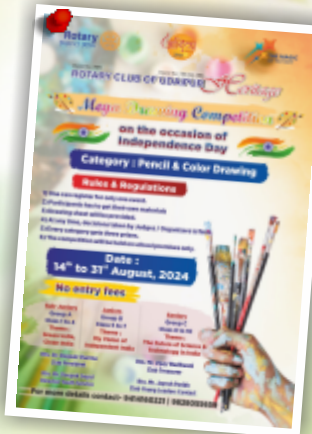
Poster of Mega Drawing & Painting Competition Released on 14th Aug., 2024