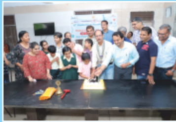
प्रयास संस्था के बच्चों के साथ केक काटते क्लब सदस्य