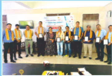
Group Photo of all Past Presidents after Felicitation

17वां चार्टर दिवस मनाया उदयपुर। रोटरी क्लब उदयपुर हेरिटेज ने अपना 17वां चार्टर दिवस प्रयास अनाथालय संस्थान के शारीरिक और मानसिक रूप से विकलांग बच्चों के साथ मनाया। रोटरी क्लब उदयपुर हेरिटेज ने पूर्व अध्यक्षों को सम्मानित किया। रोटरी क्लब उदयपुर हेरिटेज ने 17वां चार्टर दिवस प्रयास अनाथालय संस्थान के शारीरिक और मानसिक रूप से विकलांग बच्चों के साथ मनाया। रोटरी क्लब उदयपुर हेरिटेज ने पूर्व अध्यक्षों को सम्मानित किया।